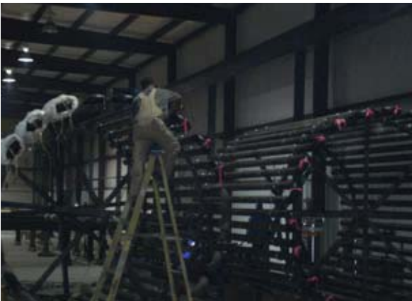
In-house post weld heat treatment.