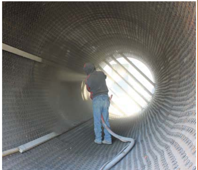
Shop/field refractory installation.