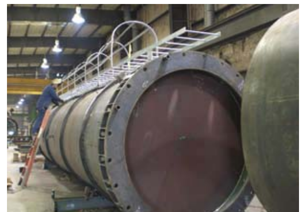
Test fit of add-on parts to ensure exact fit.