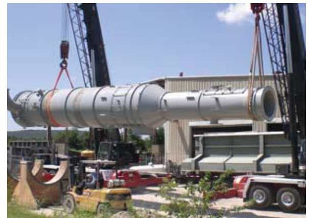
Loading finished T.O. assembly for shipping.