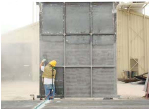
Sandblasting/painting and refractory installation done on site.