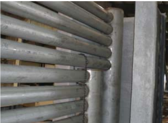
Pressure pipe fabrication.