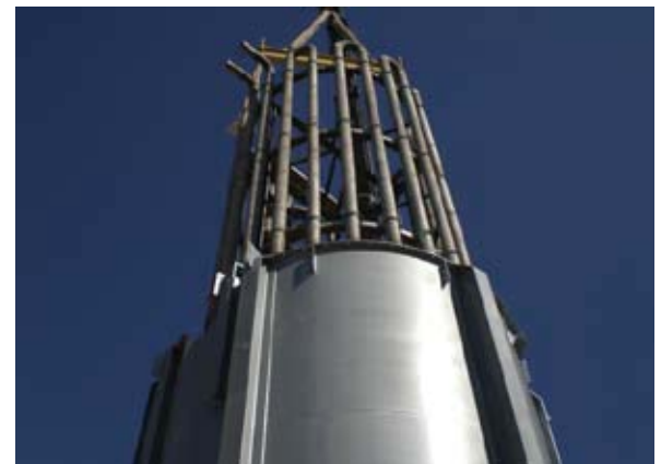
Coil housing being installed.