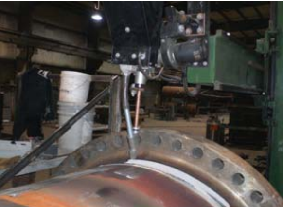
Welding manipulator for precise welds on vessels.